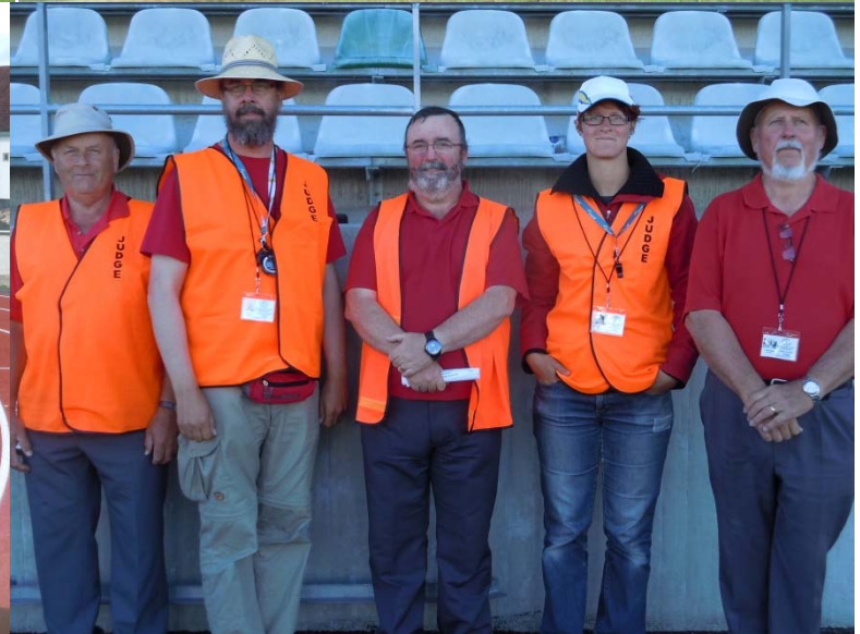
2020 WCSA Judges Seminar